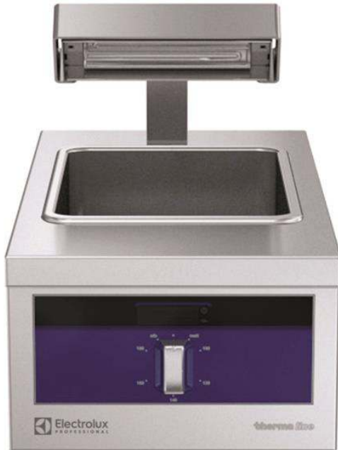
588094 Electric Chip Scuttle, one-side operated, 1/1 (MAYAAADOBO) GN